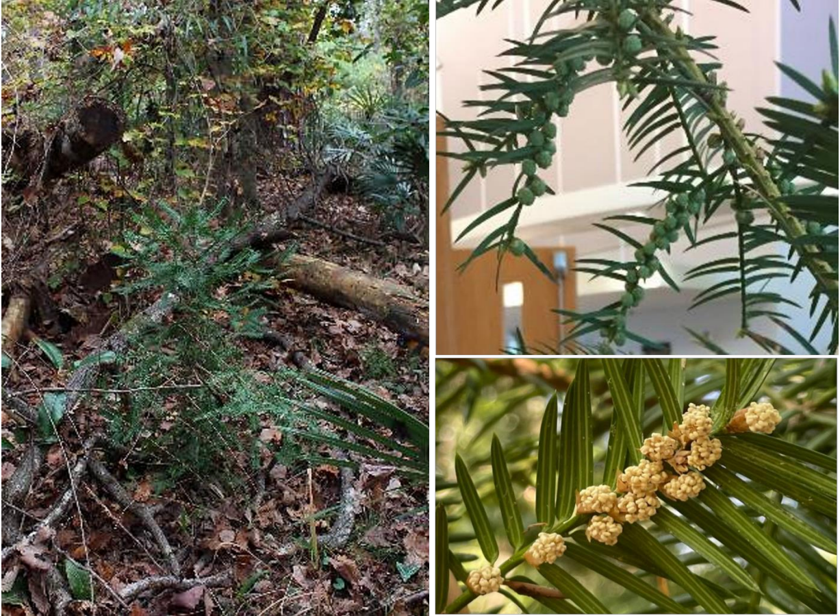
Torreya taxifolia (Liberty County, Florida) and reproductive female (top, 2018) and male (bottom, 2021) cones.

U.S. Fish and Wildlife Service Southeast Region Florida Ecological Services Field Office Panama City, Florida