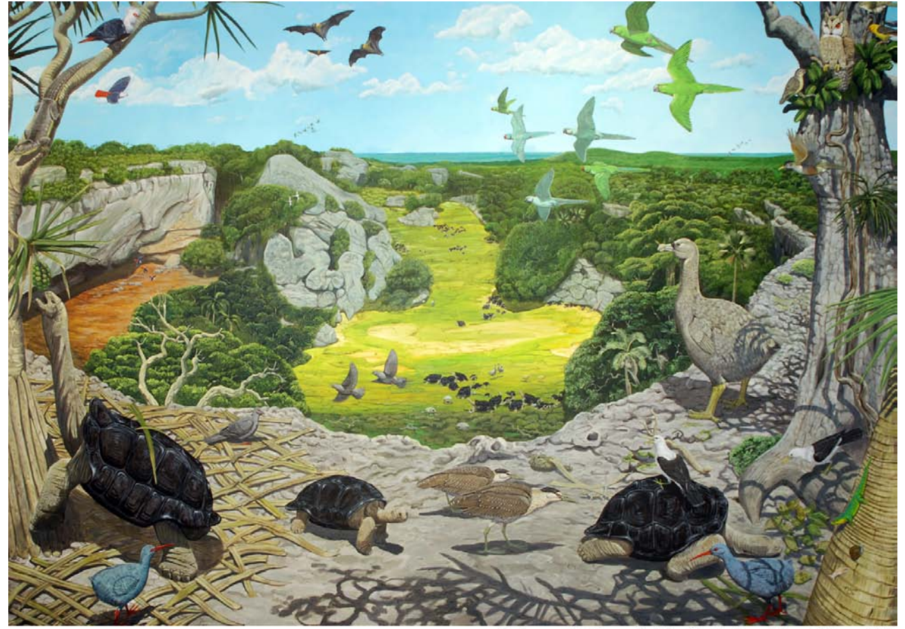
Prehuman Rodrigues.

I have been an advocate for this approach – reintroducing the "megafauna" back to lands where they are extinct, or their