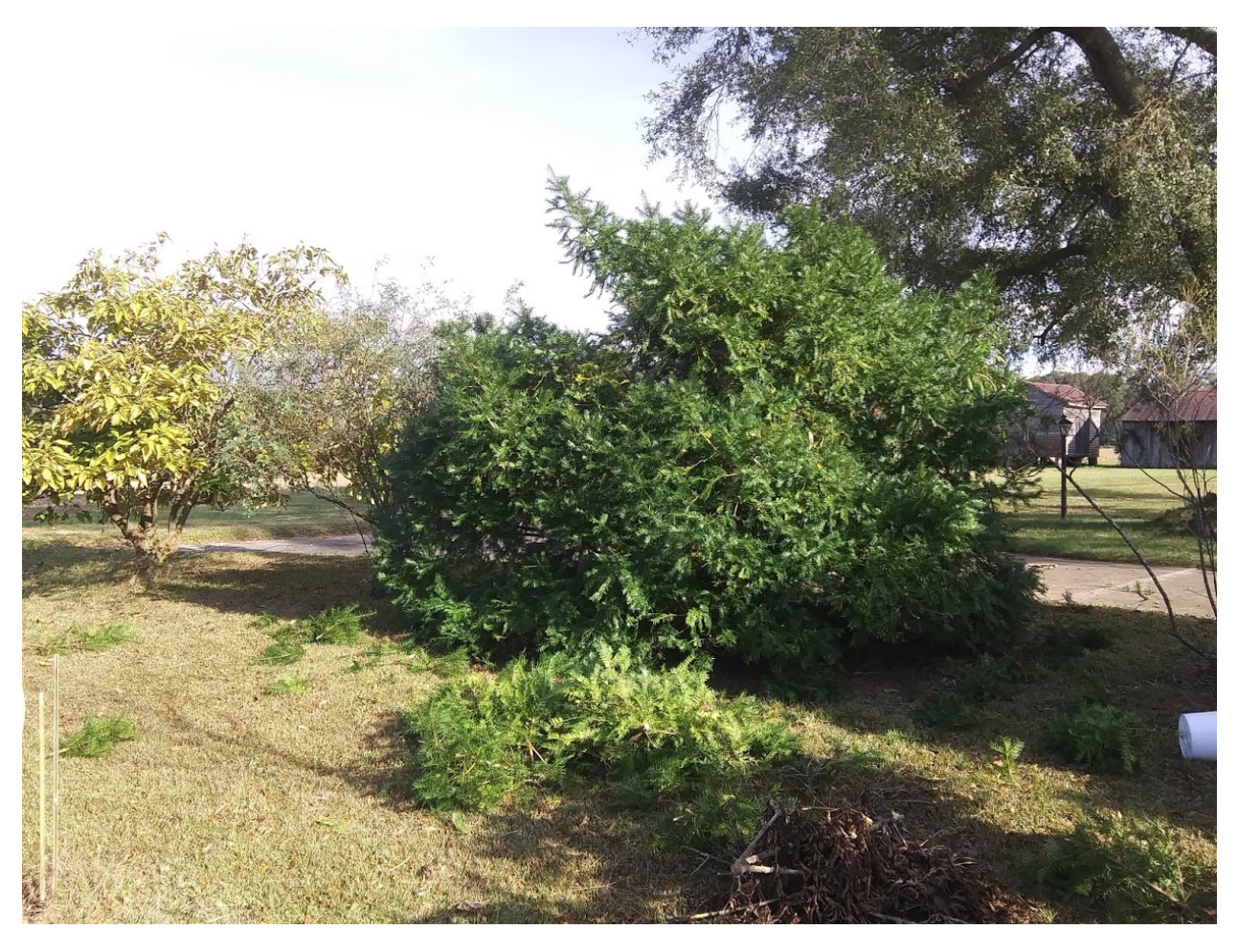
A view of the sunnier side of the smaller torreya after limb removal and a "shape up" with the hedge trimmers.