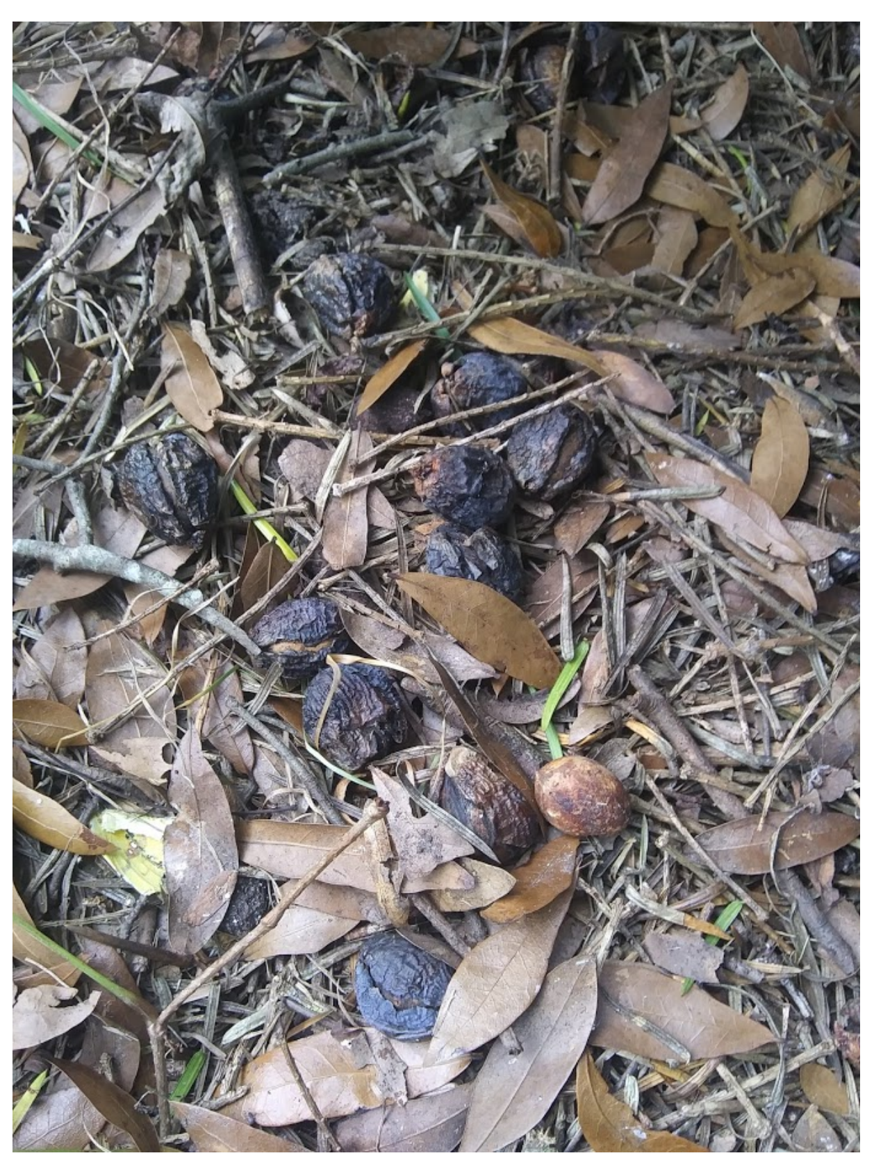
Examples of some of the very dry seed on the ground at Mt. Olive. Seeds which audibly rattled were not collected.