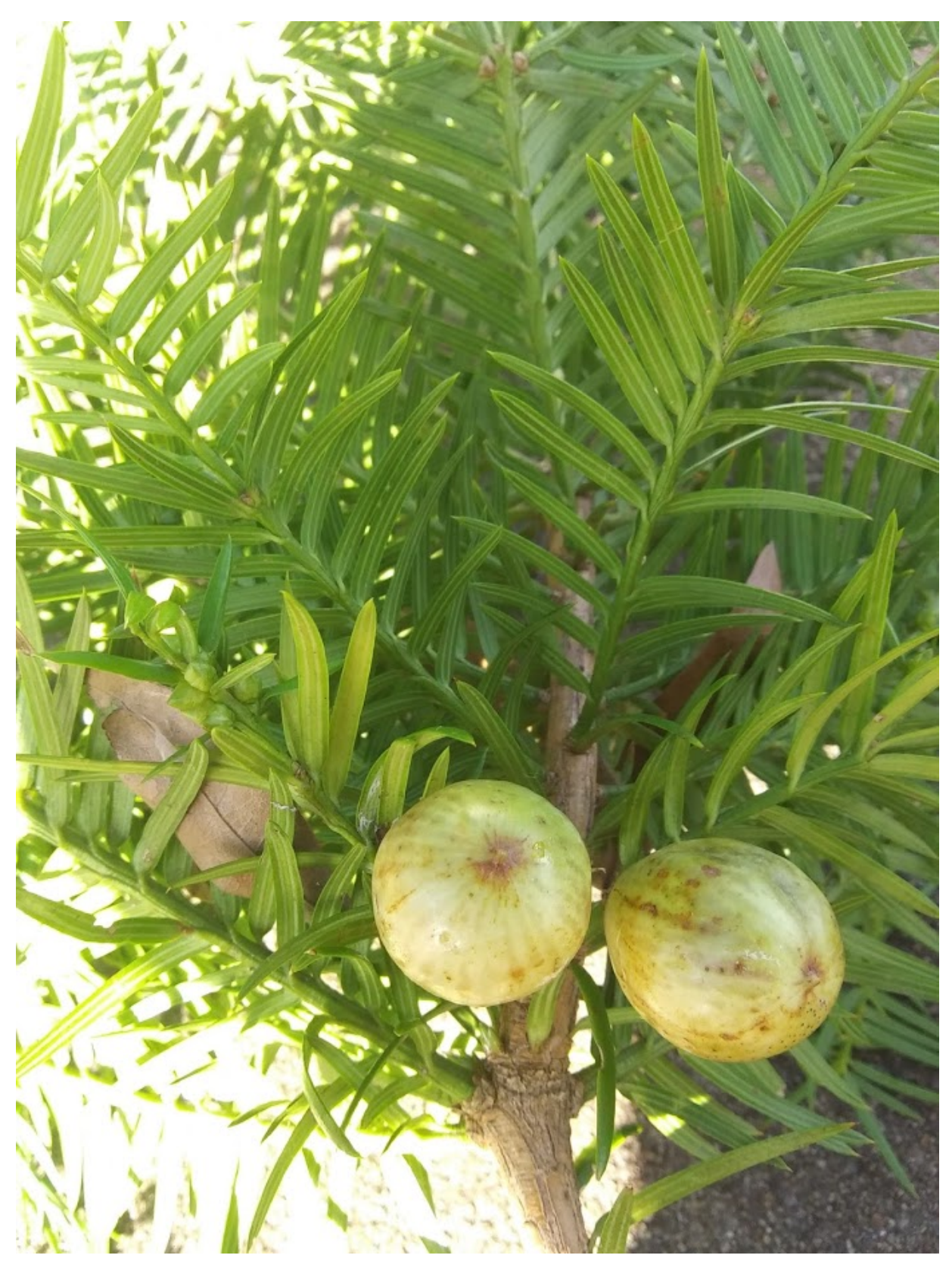
Branch from the smaller Mt. Olive torreya showing nearly mature female cones, as well as buds which will form female structres in the following year.