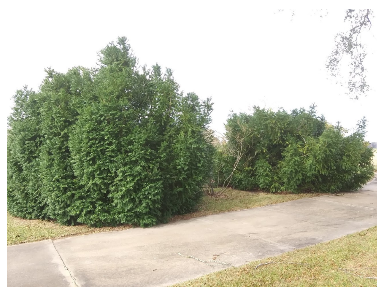
The two Mt. Olive torreyas at the Bullard residence. The tree on the left still has a central leader, while the tree on the right is assuming more of a multi stemmed shrub form. October 31, 2020