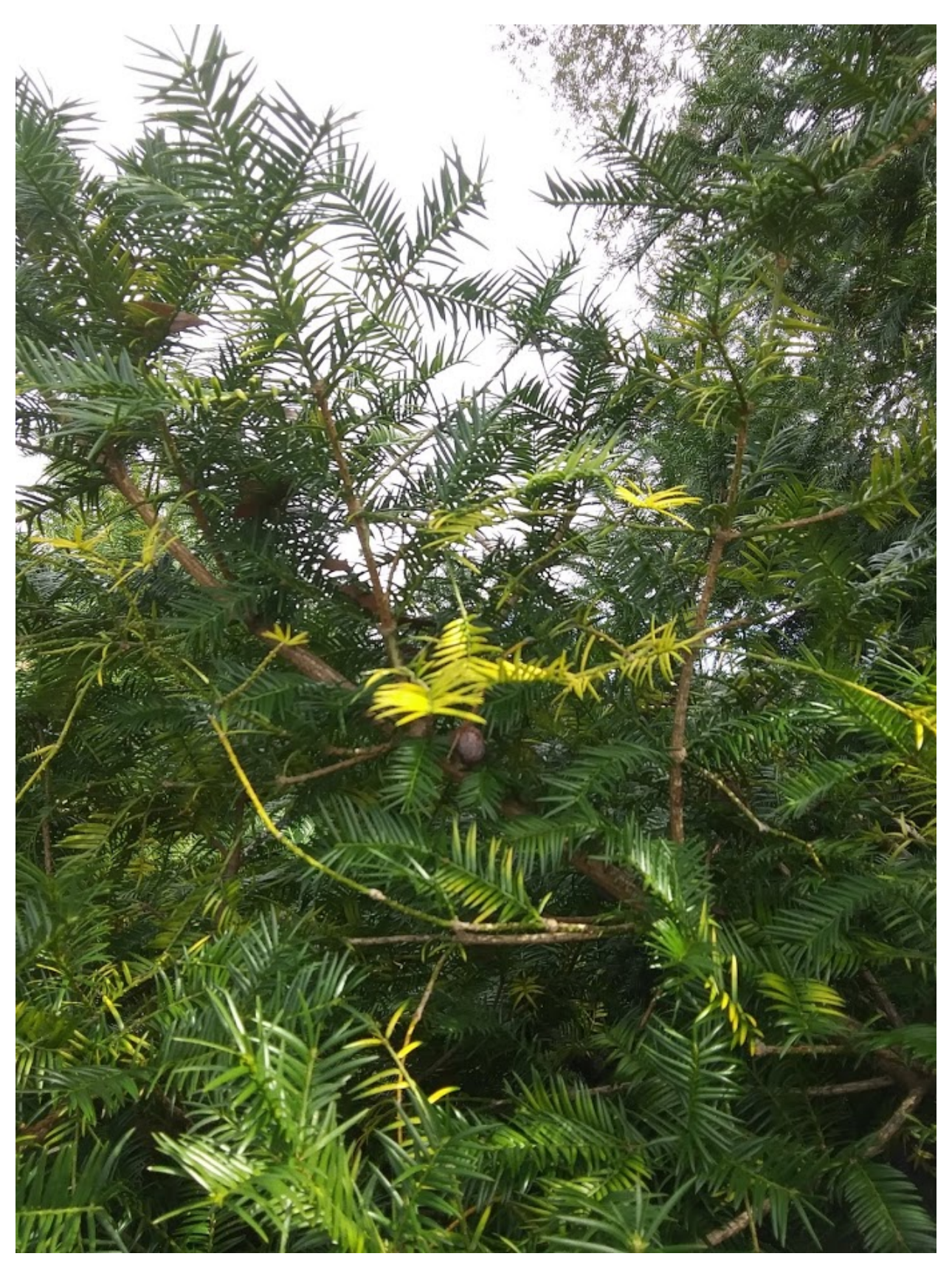
A close of up some of the yellowing and needle loss occurring on the smaller Mt. Olive tree.