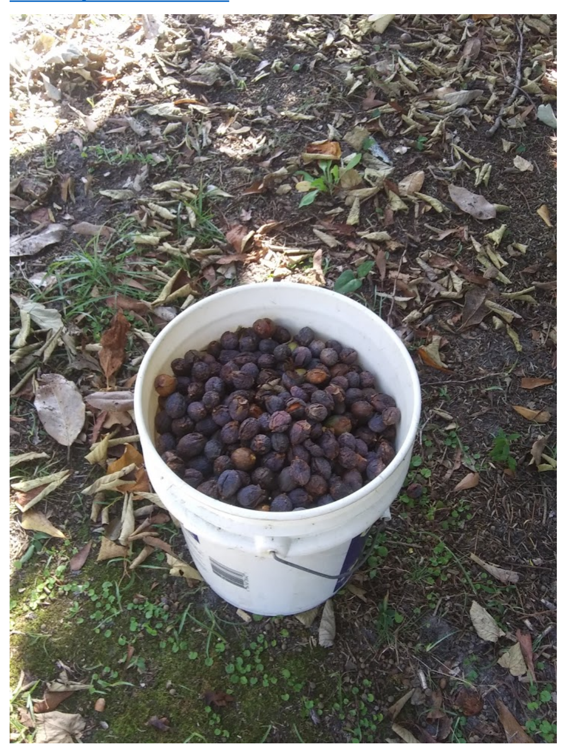
A 5 gallon bucket of female cones collected from the Clinton NC tree (1,383 seeds), on 31 October 2020. Note the dry and split sarcotesta on the majority of the cones collected on the ground below the tree.

Note by Editor: This report on the Clinton NC tree and its photos will be posted on and attached in pdf to the existing Torreya webpage on the history and seed production of this mature Torreya tree in Clinton NC.