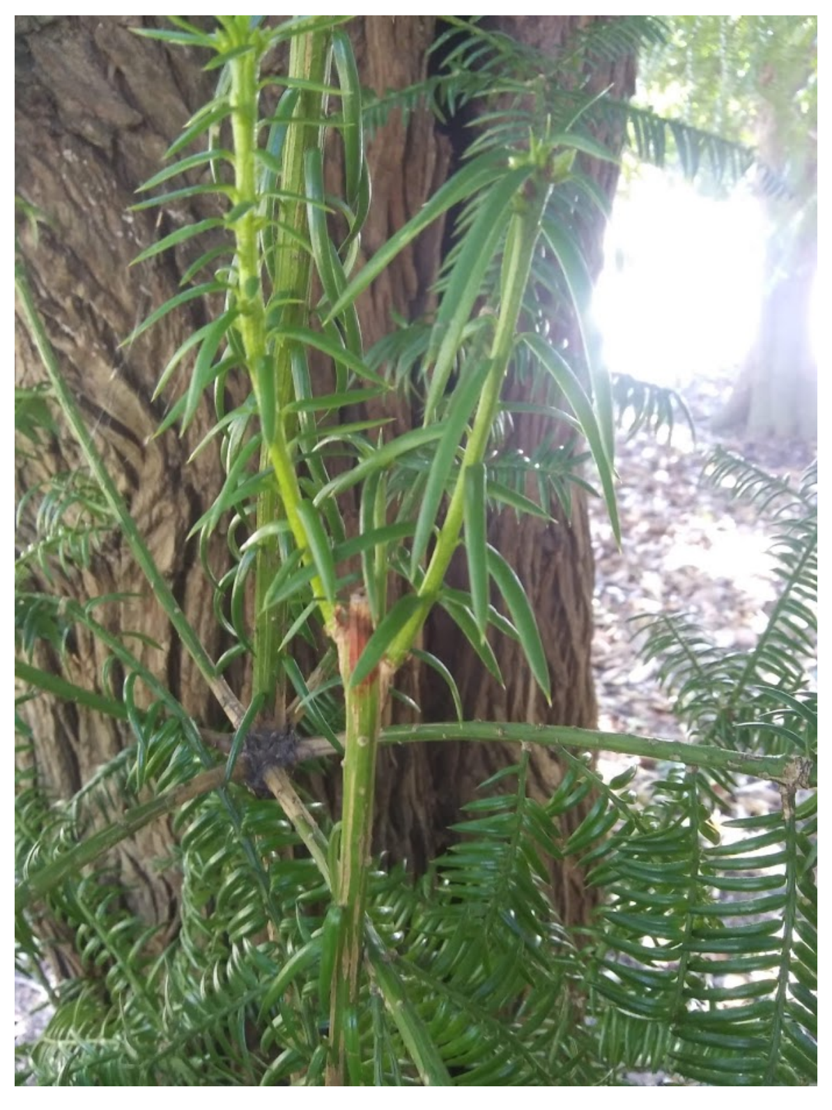
Apically dominant re-growth in 2020 on basal sprouts where cuttings were previously taken in 2019.