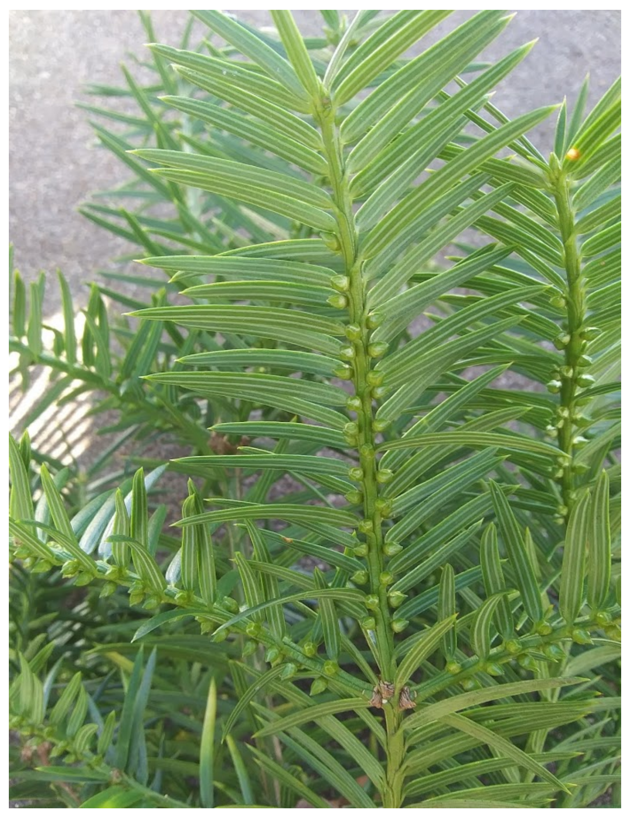
Branch also from the smaller Mt. Olive torreya showing buds which will form male structures in the following year.