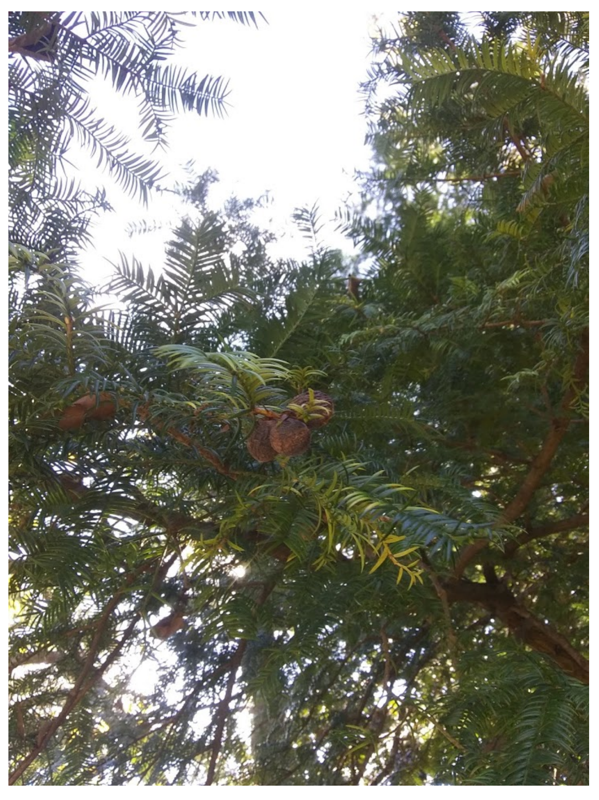
Dry female cones still firmly attached to the branches of the Clinton NC tree, 31, October 2020.