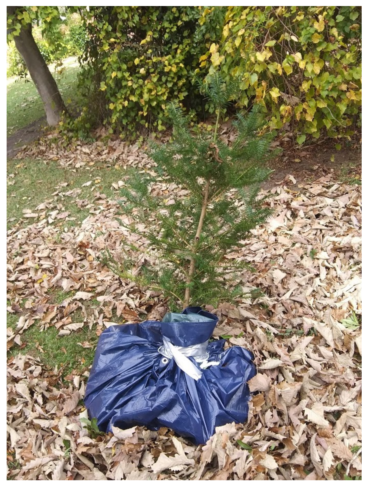
Juvenile tree (approx. 4') dug from behind the house with a large root ball secured with tarp and tape. Oct 2020